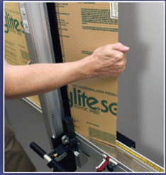
Acrylic Scoring & Breaking