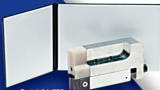
Part # 04-779

Since 1868, Fletcher-Terry has revolutionized advanced cutting solutions for numerous global industries. Our versatile FSC™ Multi-Material Cutter features an interchangeable cutting head design ensuring that this machine will never become obsolete, as Fletcher upgrades its blades to match new substrates as they enter the market. The FSC cuts aluminum composite and aluminum sheet materials, debris-free, enabling you to place it in the same work area as your dust-sensitive printing device.