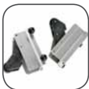
Spring Loaded Bar Clamp Lifters