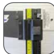
Quick Set Locator Pin Spacing