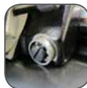
Ball Bearing Precision Rollers