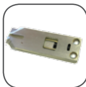
Removable Pre-Set Blade Cartridge