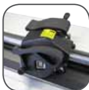
Dual Ergonomic Cutting Head