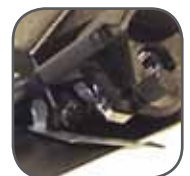
Magnetic Sight Line Cutting Gauge