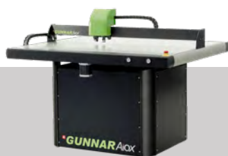
GUNNAR AiOX Professional M