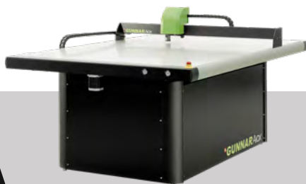
GUNNAR AiOX Professional XL